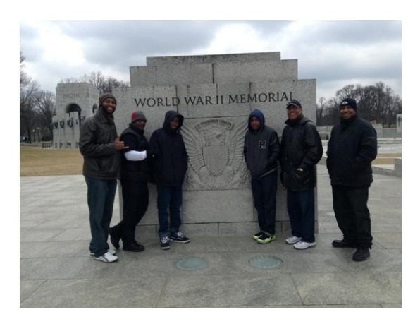
Brothers at WWII Memorial

After leaving the Memorial, the brothers, beaux and guests visited the Smithsonian Museum of African Art and the World War II Memorial.