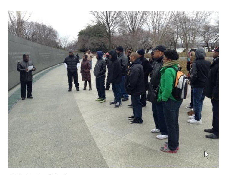
Pi Upsilon Lambda Chapter brother reciting history on an MLK Memorial quote.

Director of Education, PUL Chapter 2012-13